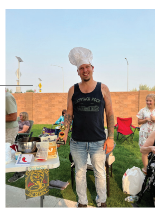
Chili Contest winner!